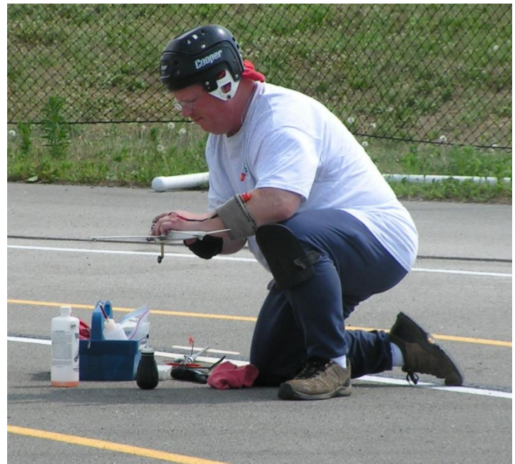
Ye Old Editor Tuning The Mouse 1 Entry at The 2013 Nat's.