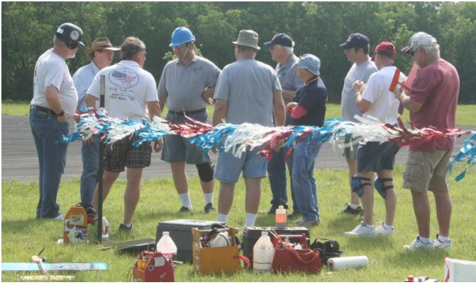
Typical Texas Pilot meeting....Ok, no back biting, back siding or back talk.