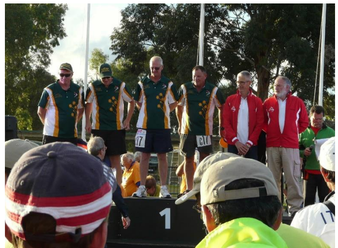
F2C Team Winners.