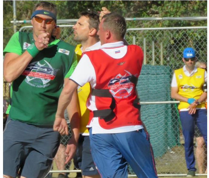
F2C Semi Final.