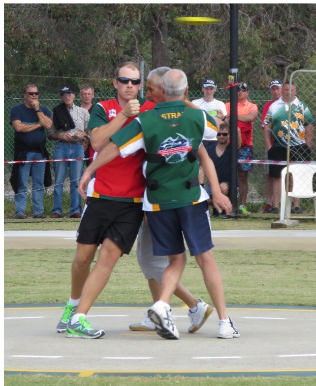
The F2C Final at the recent World Champ's in Perth Australia. The Aussie's finished 1-2, the French were 3 rd .