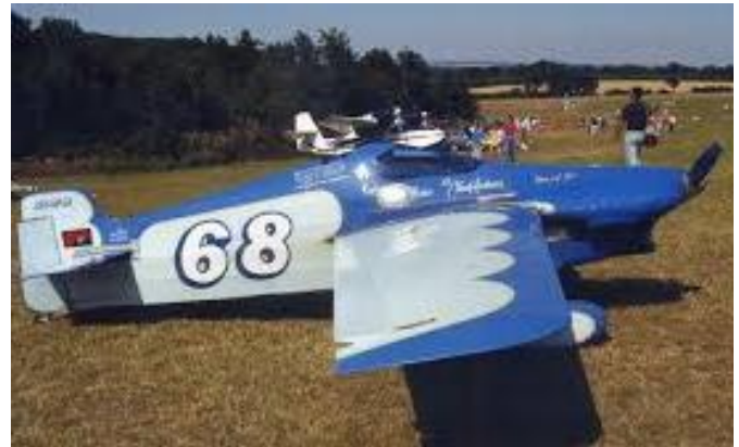
The actual "Real Sporty" F1 racer.

June sport Goodyear just for fun. More recently he built the small rubber powered Sterling Real Sporty. He happened to mention the idea of a sport Goodyear version of "Real Sporty". That got the wheels turning in my brain. I found downloadable kit plans on Outerzone , and got my local print shop to scale them to Goodyear size and print them for me. I have completed the basic plans, and now they will be turned into a complete and pretty set of plans. Hopefully, they will appear in the August issue of Torque Roll.