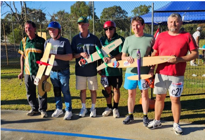
Podium placers in the Classic-FAI Team-Race event. Well supported and much enjoyed by all.