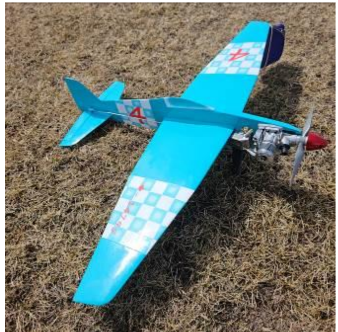
We'll be seeing more of Gerry's Fora powered Alley Cat in the future...guaranteed!