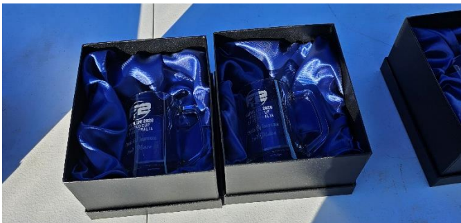
Very nice etched glass mugs were provided for the Classic T/R event.