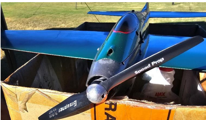
The winning "Turtle" model of Rob Metkemeijer with classic FMV engine & classic "Metkemeijer green" paint scheme.

For Sale Randy's racing tanks & Don's fastfills $20 + post