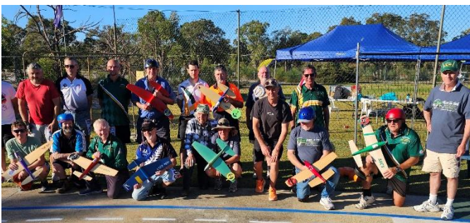
Classic FAI Team Race competitors came from many nations.